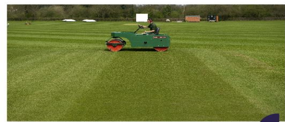
Maintaining Your Cricket Ground

Resources developed in partnership with the ECB