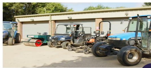
Cricket Health and Safety