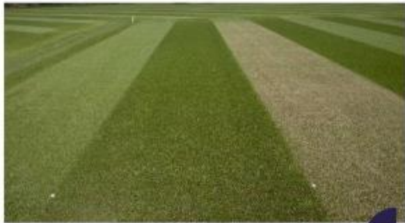
Creating a Pitch Plan