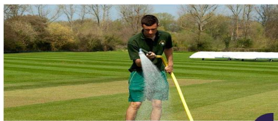
Watering and Drought Management

There are 6 searchable sections within the Cricket Pages.