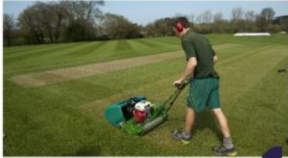
Pre-Season Mowing the Square