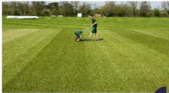
Fertiliser and Pest Control