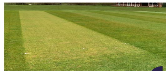
Hybrid Cricket Pitches