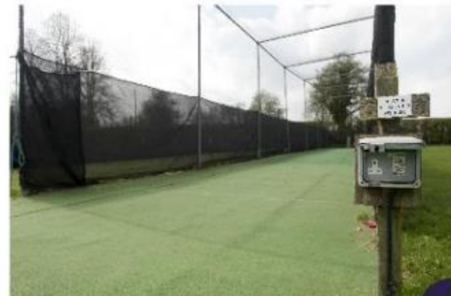
Non-Turf and Practice Nets