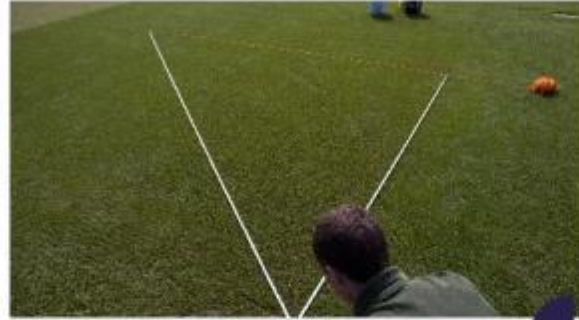
Squaring the Square and Marking Pitches